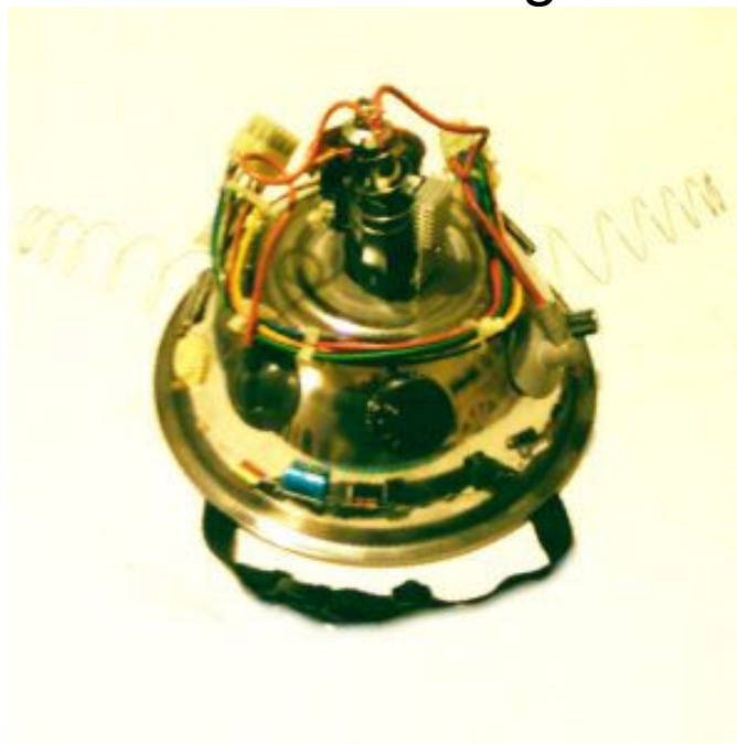
Home Brew Tin Hat with active confuser circuit

Gainfully Unemployed Group: Thurs. 26 th July Next Coffee Night: Thursday 28 th July