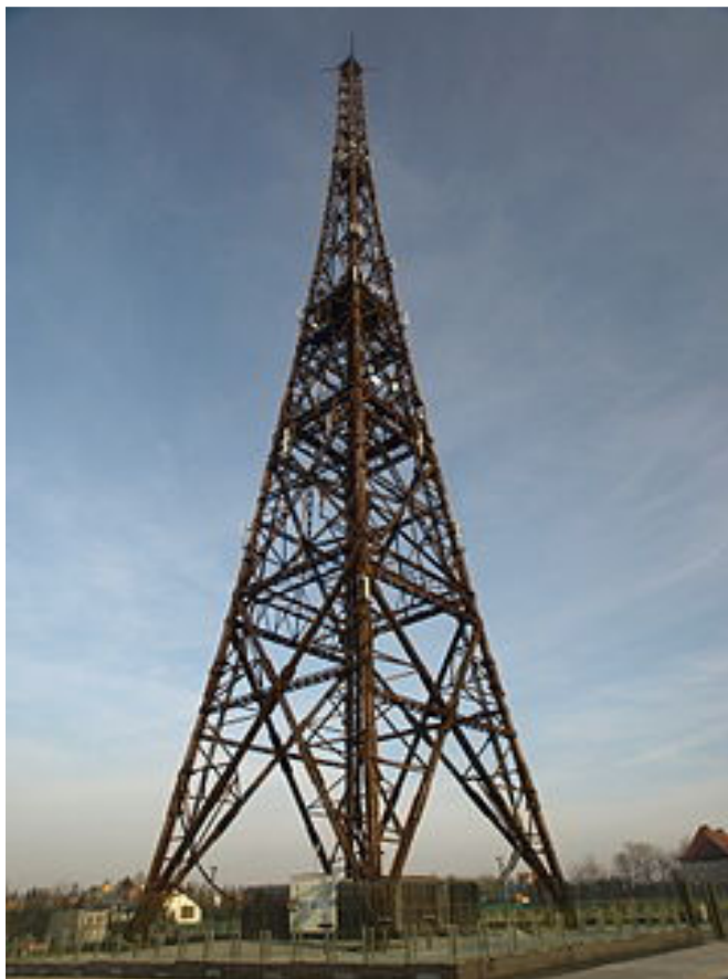
The mast today.

At 118 m (387 ft) high the tower, constructed of an impregnated larch wood framework is located in Gliwice, in the South of Poland. The tower's longevity is assisted by the use of 16,000 brass screws – no iron was used because it was thought to affect the aerial efficiency.